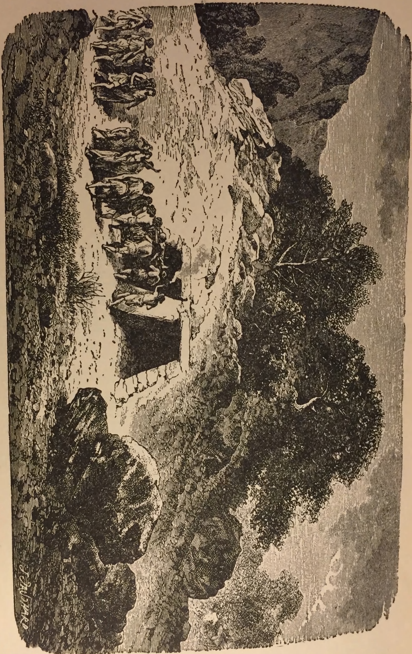
Death and Burial of Orna. (Page 52)