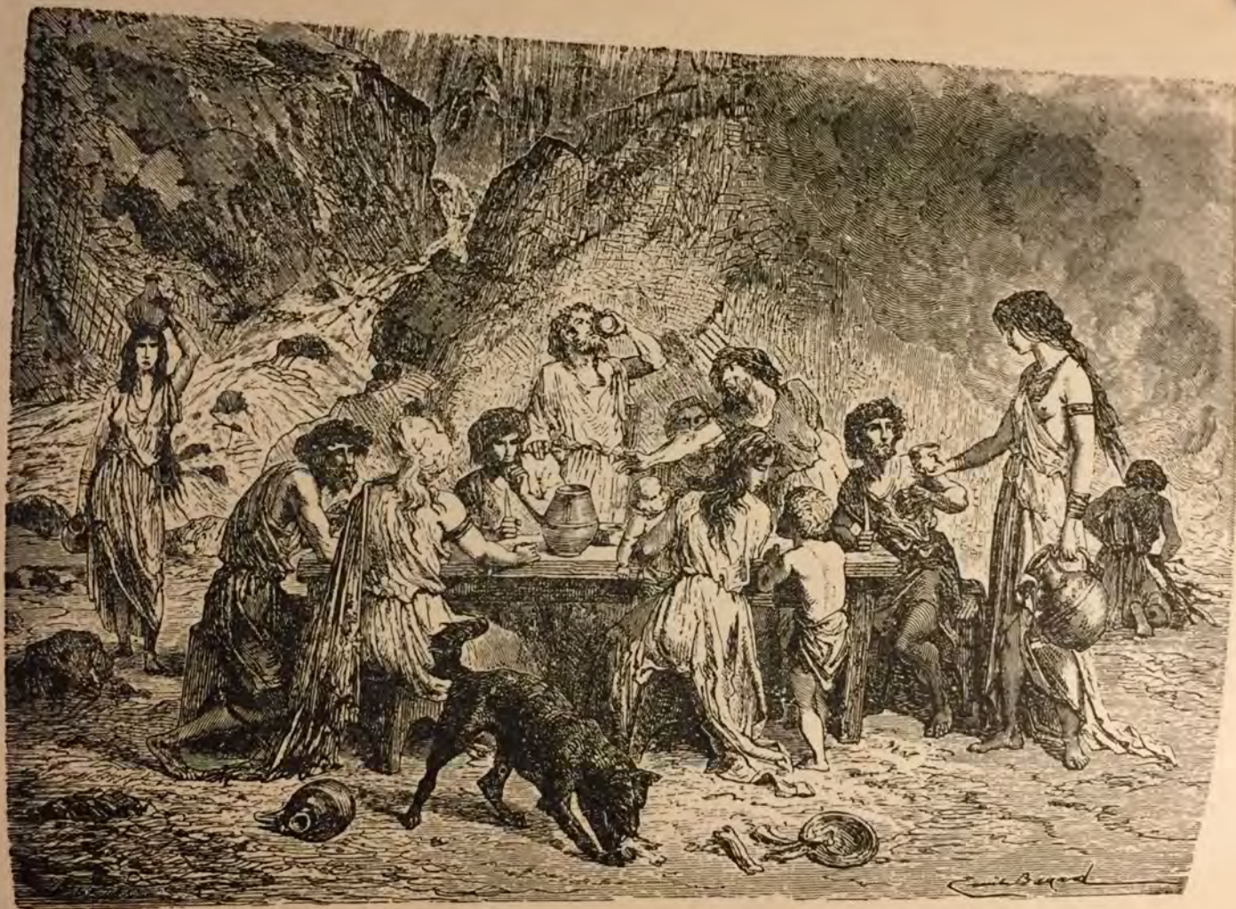
Awaiting the Subsidence of the Waters