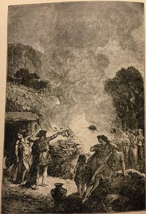
Morven Burning the "False Prophets."

"A true prophet hath honor, but I only am a true prophet."