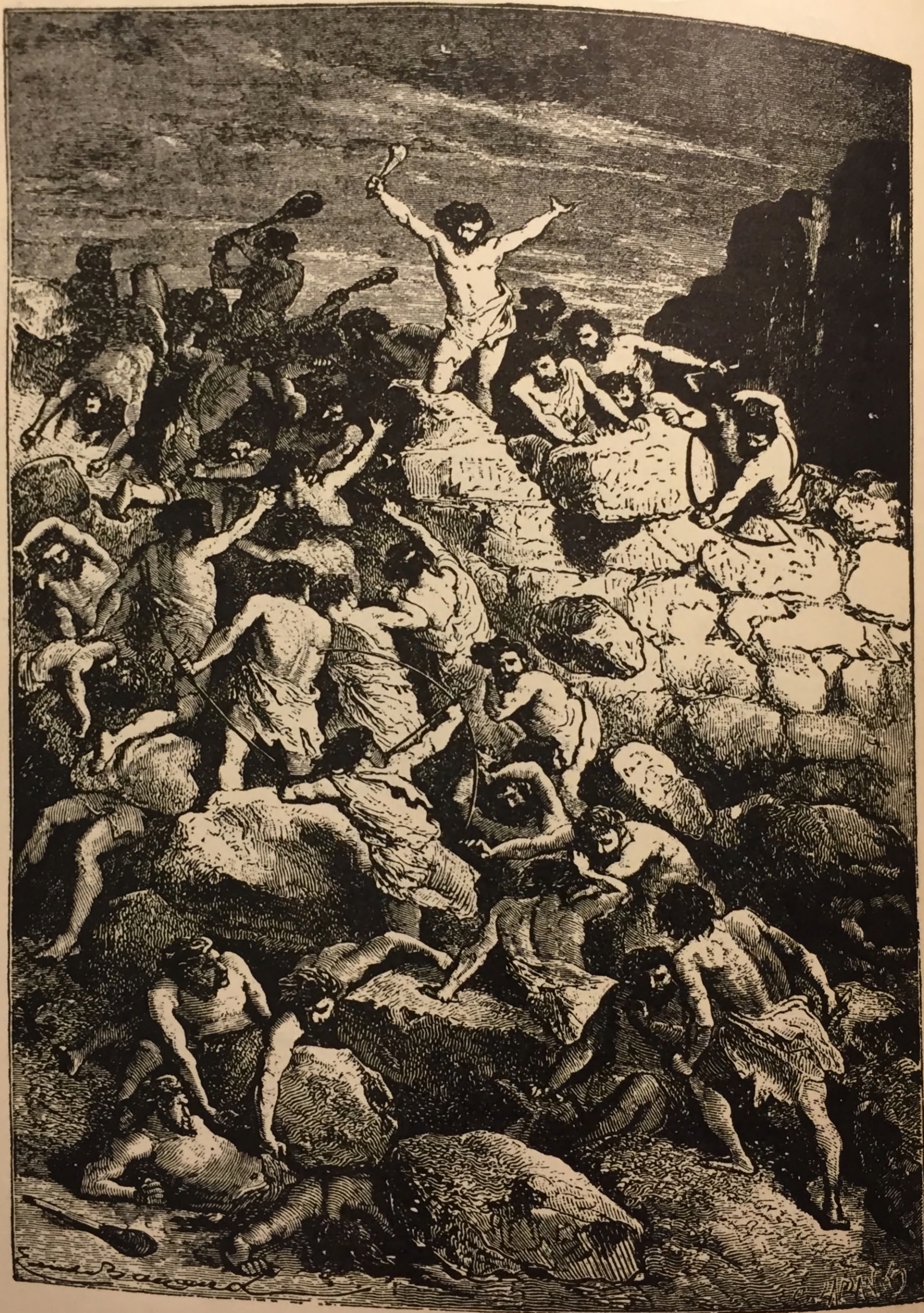
Massacre of the Alrich tribe in the cavern of Oderlin.