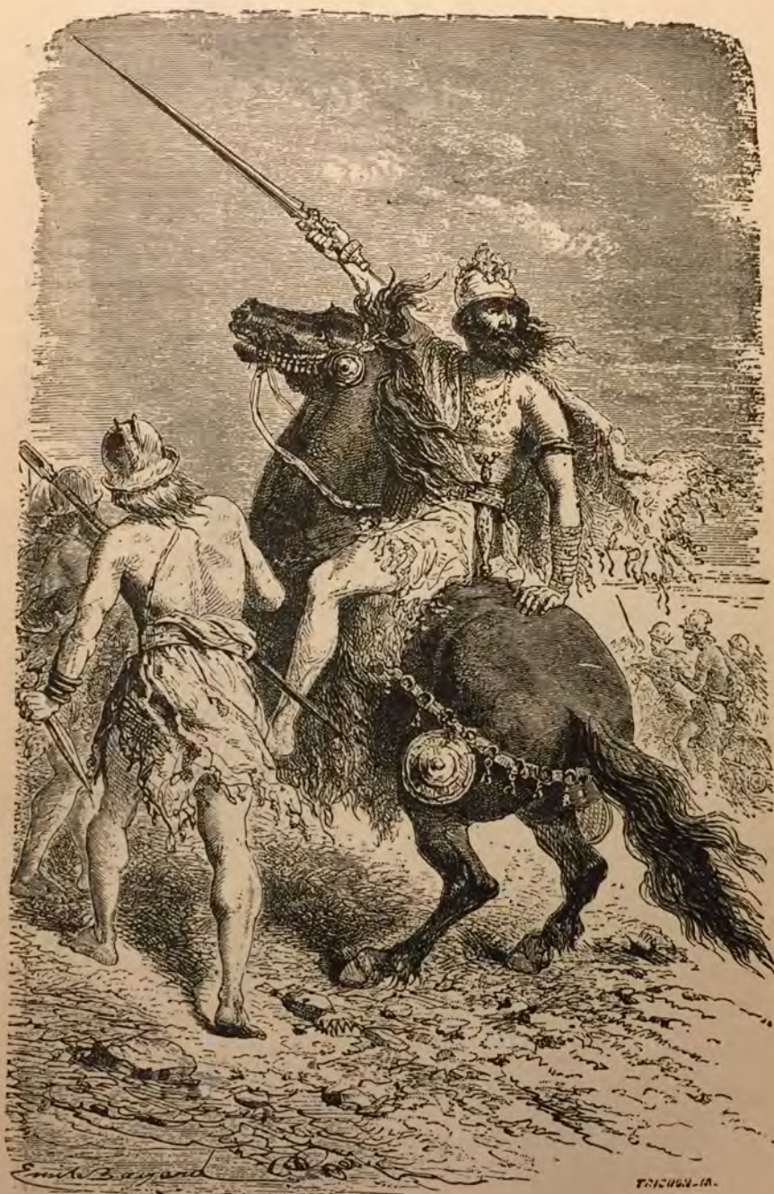
— Summoning the Oestrich Tribe to Arms!