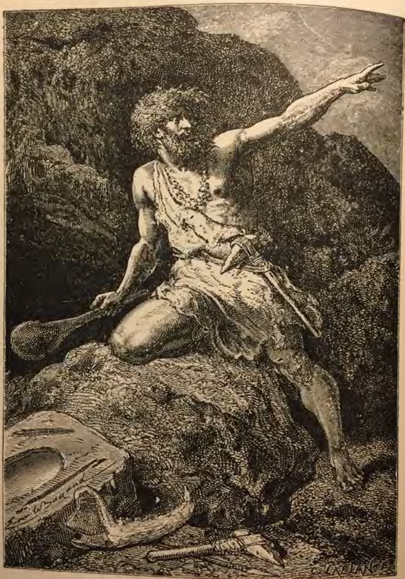
Morven Communing with the Star.