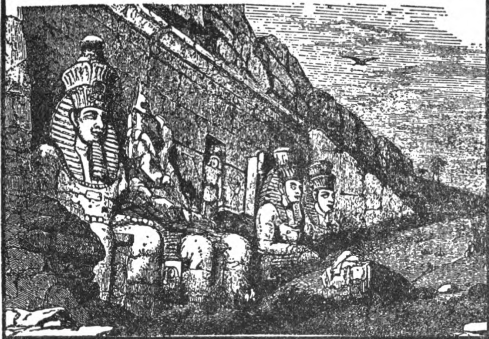
ANCIENT VIEWS OF EGYPTIAN AND INDIAN TEMPLES ERECTED TO THE GODS.