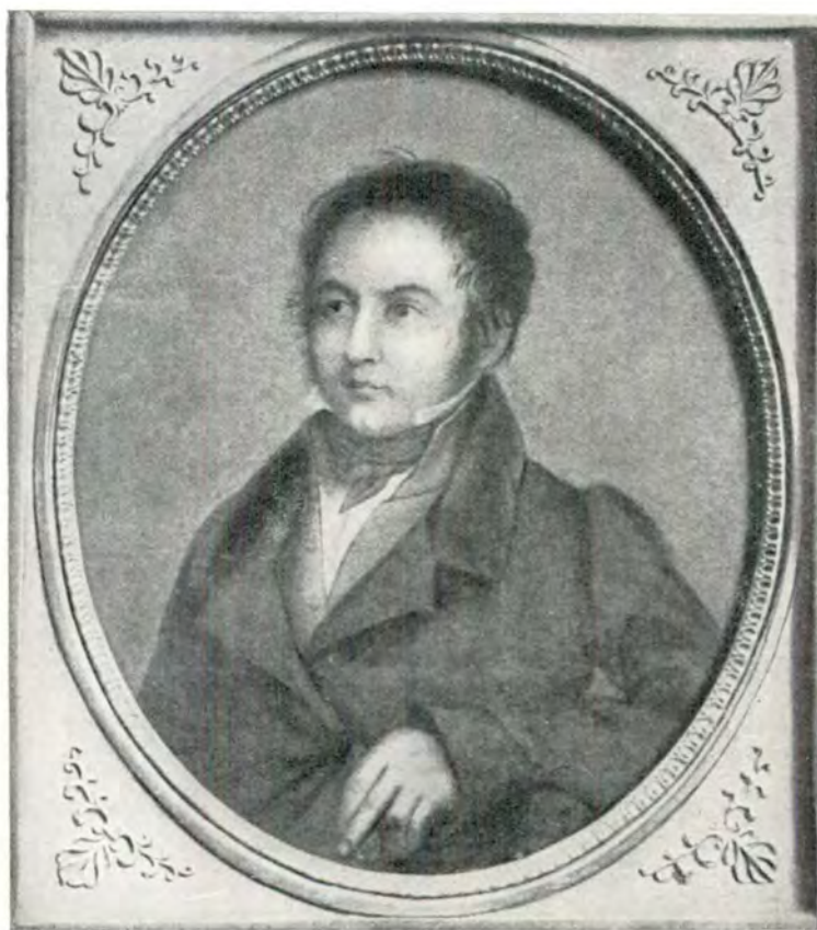
FABRE D'OLIVET (1768-1825)