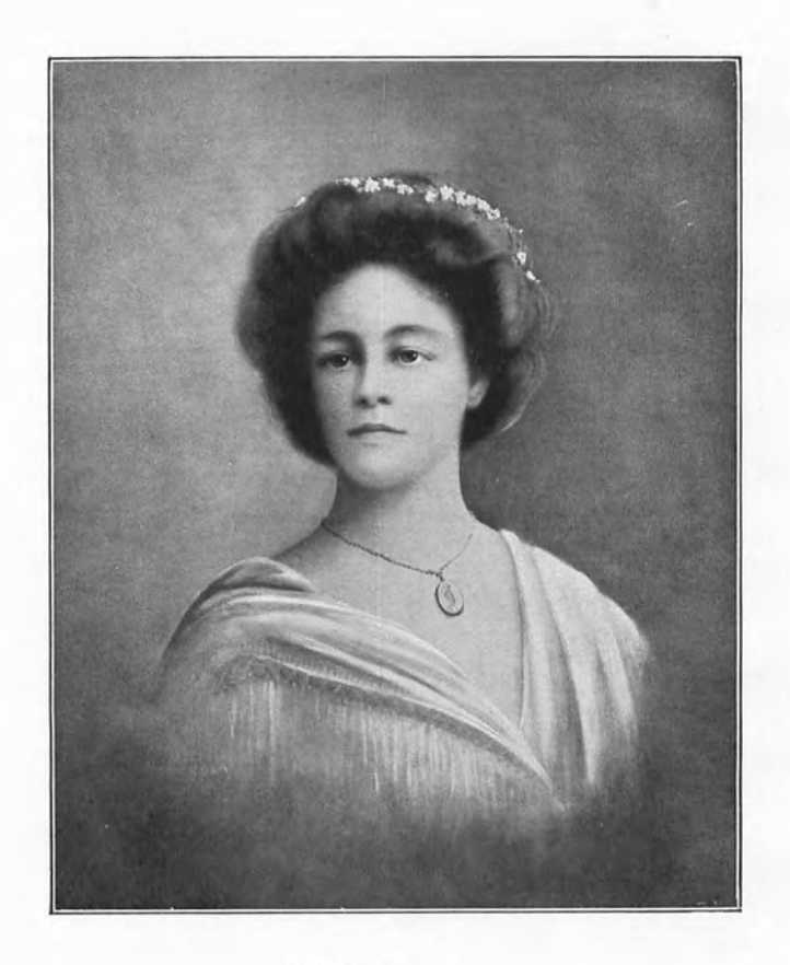
IOLA. 29 JAN., 1911.