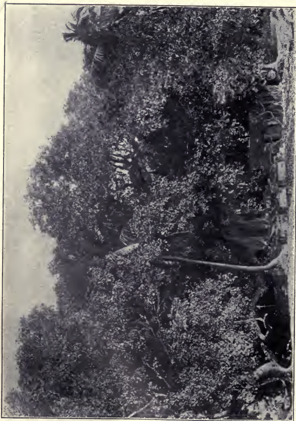
Râmakrishna's seat protected by the bent branch of the big tree