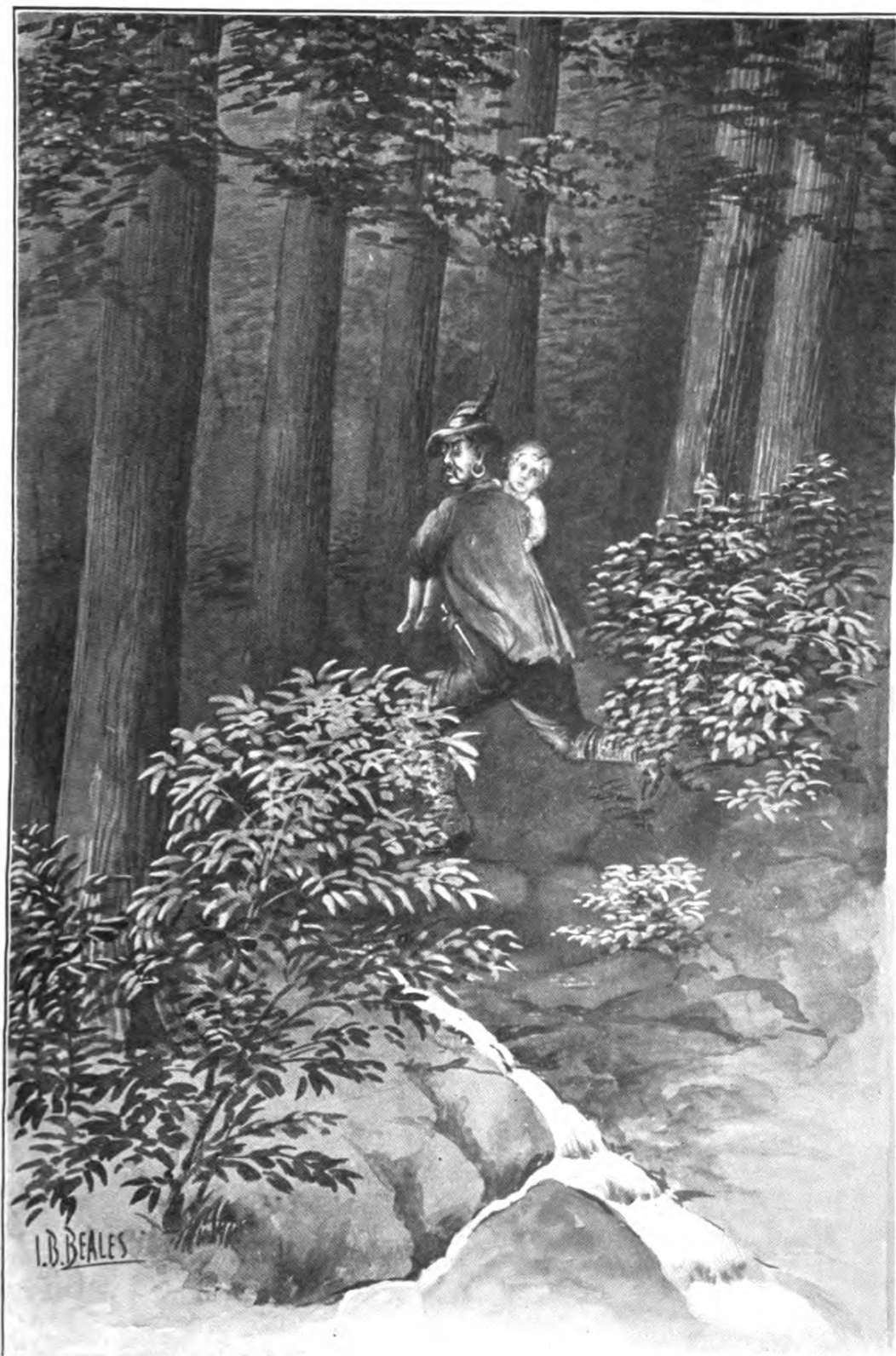
The Gypsy Abducting Little Wilhelm Albaird—Page 133