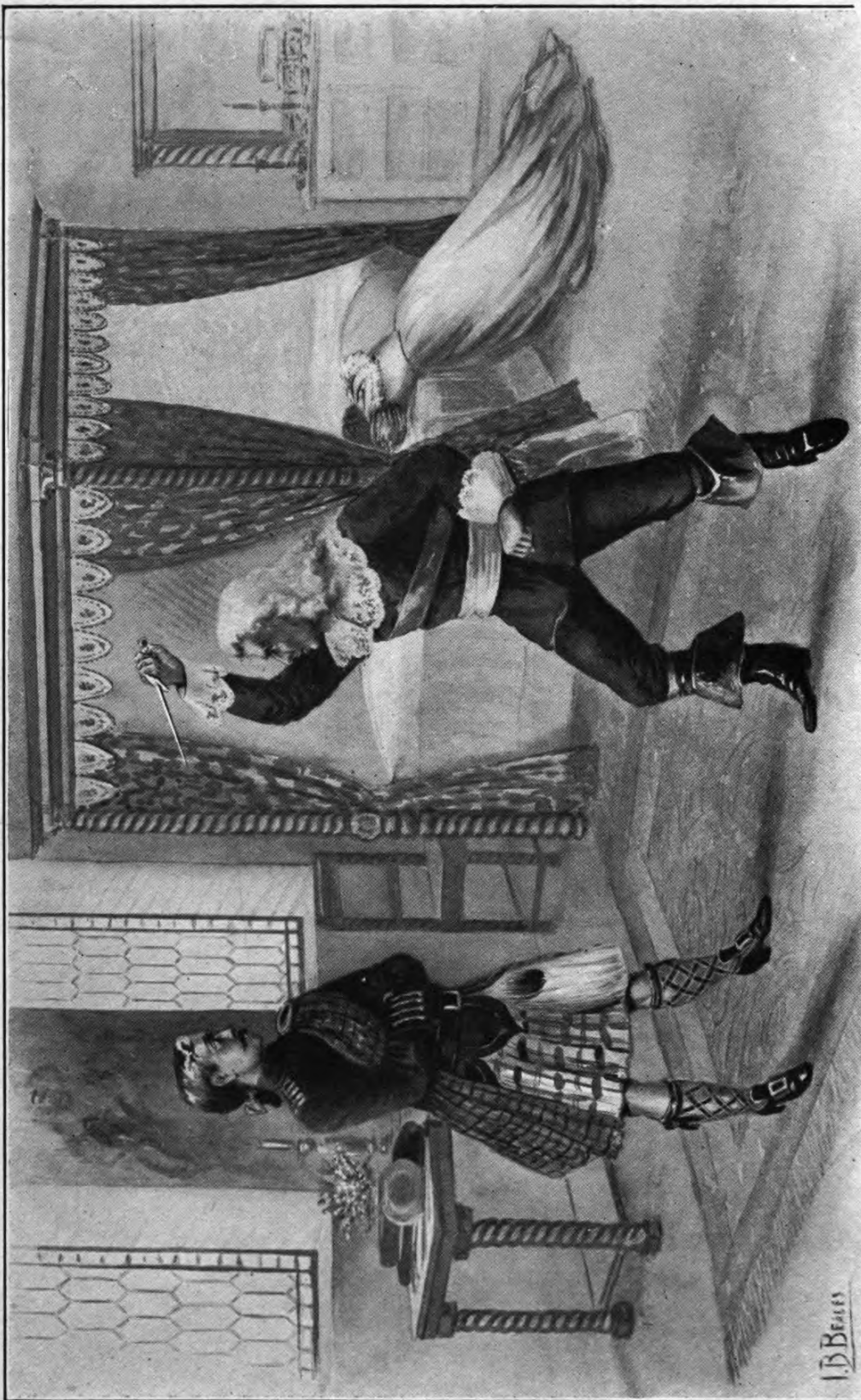
"Strike, Man, Strike!" — Page 55