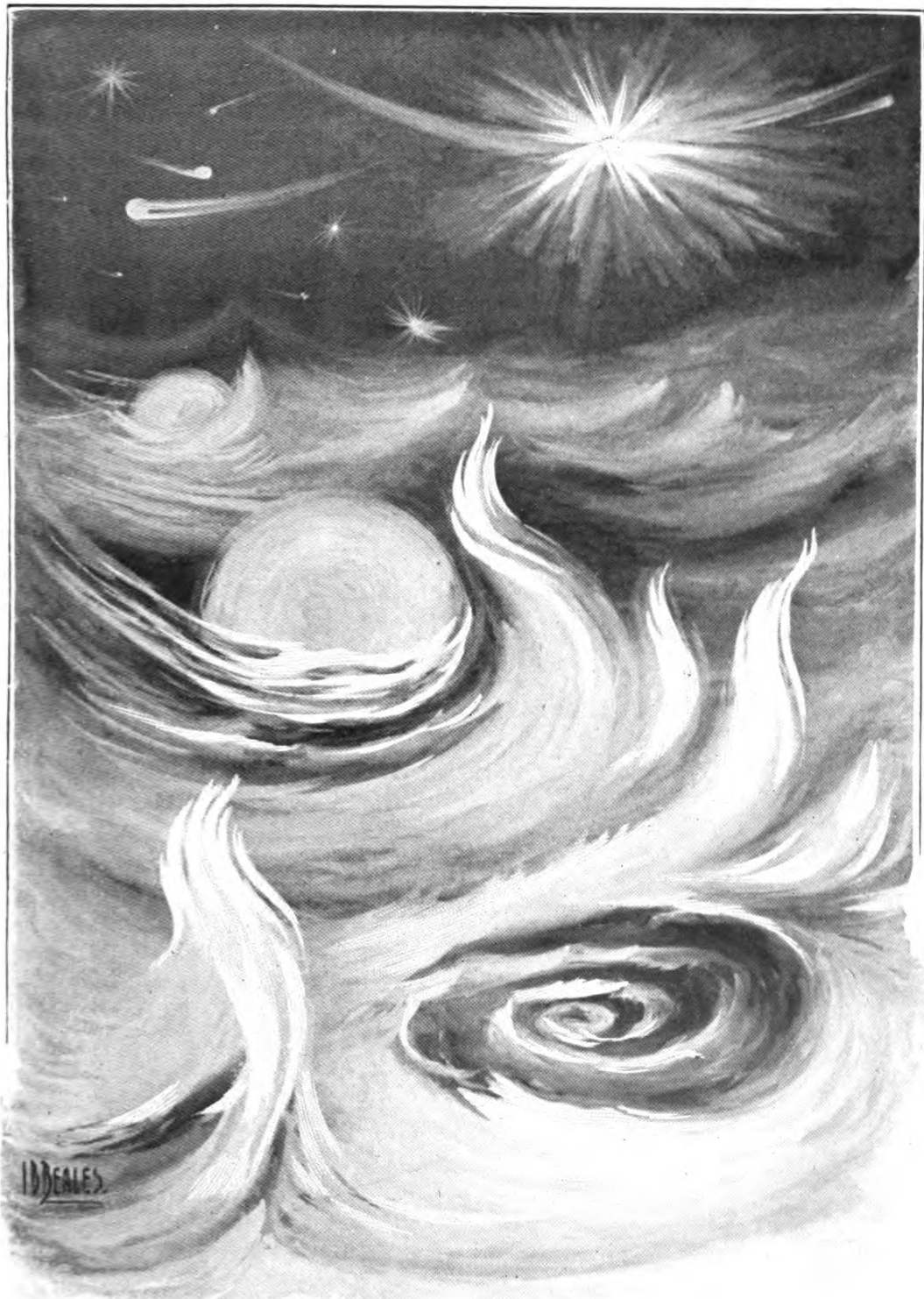
The Creation of a Sun—Page 67