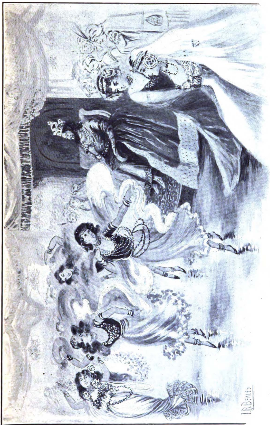
The King and the Dancers—Page 171