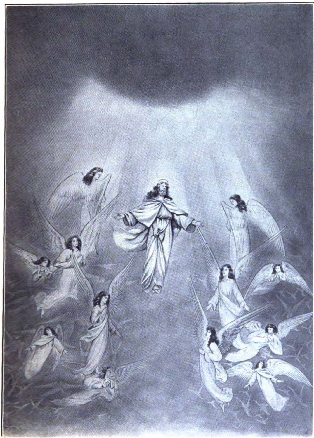
“Christ Ascending to the Shekinah.”—Page 122