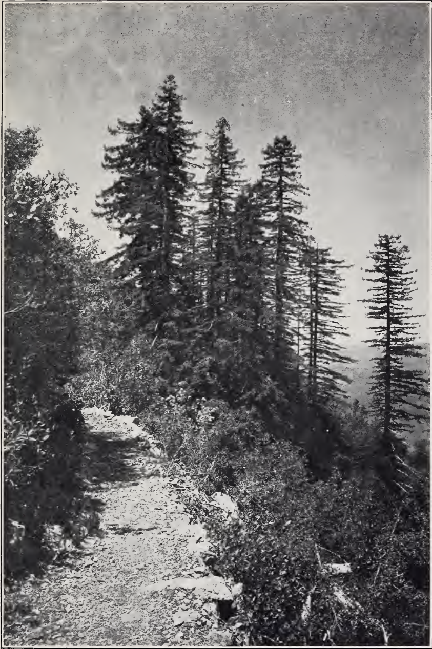
"Gazing across immense chasms of boundless beauty."