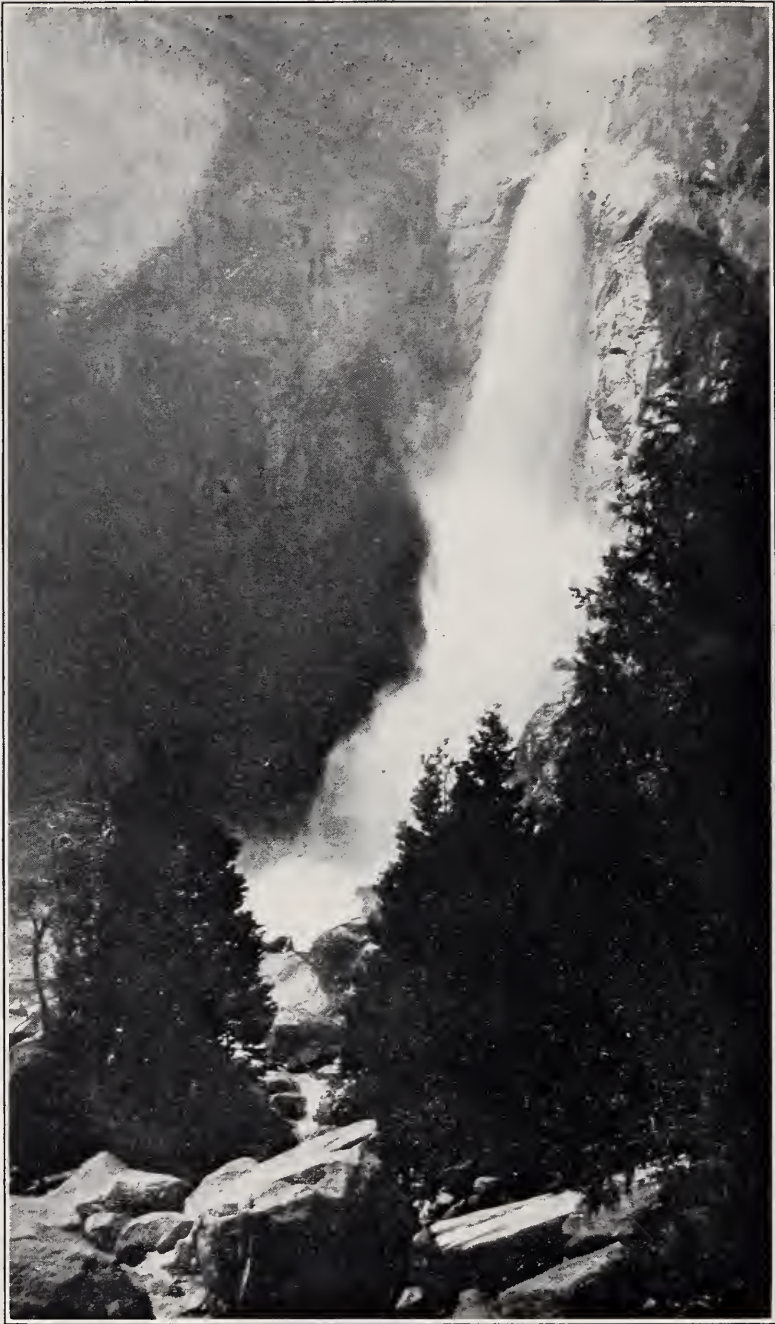
"Bright waterfalls dance, and birds carol all day."