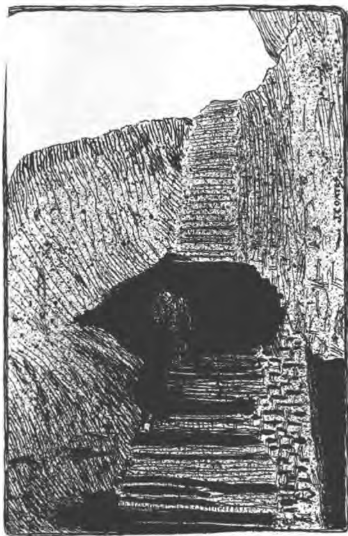
FINGAL'S CAVE, STAFFA, SCOTLAND.