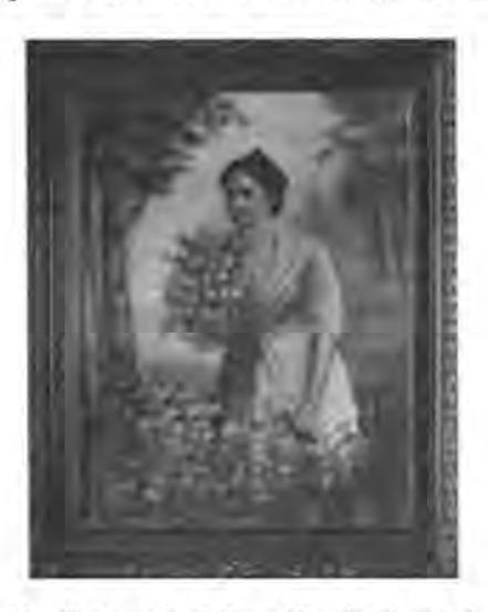
Fig. 68.—Photograph of the spirit-painted portrait of the late Mrs Ella Leamon-Leach, produced in the presence of the Bangs Sisters.

canvas, on a frame 36 \times 48 inches, was selected and placed before the window—which was four stories from the ground—in such a way that the light fell on the back of the framed canvas. The colours began to develop in about four minutes, particularly rose