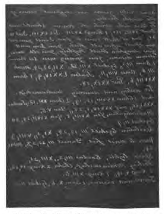
Fig. 85.—No. 3 Plate of Birmingham psychographs.

Mark xvi, 9; Mark xvi, 17; John xiv, 12; Acts ii, 29; Acts iv, 31; Acts xvi, 26; Roms. i, 2. Then carefully read 1 Cor. xii, 1-31; the exhorta-