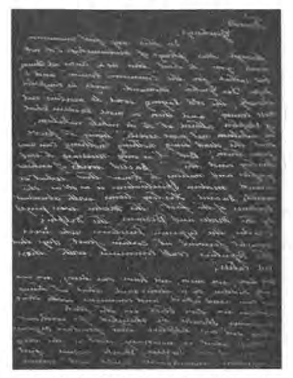
Fig. 83.-No. 1 Plate of Birmingham psychographs.

the commium bonum (2) and I hope, dei gracia, thousands will be comforted thereby. The old saying was de mortuis nil nisi bonum (3), and then a more modern school of sceptics altered it to de nihilo