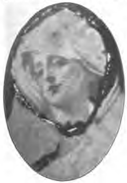
Fig. 14.—Photograph of the foregoing "Cyprian Priestess" magnified, showing the inartistic joining of the head to the body.

The first psychic photograph was that of the socalled "Cyprian Priestess" (see figs. 10, 11, 13, 14). Although the face is distinct, the drapery is different from that in former photographs, but reveals, in quite a natural position, a plump hand and arm held across