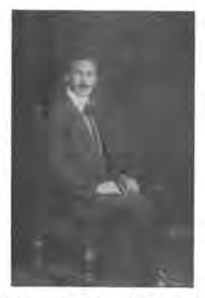
Fig. 40.—Photograph No. 7 of Mr Brittlebank's parcel; and psychic "extra" of Kaffir Umfaan or servant boy of the sitter, taken under test conditions.

No. 3. Photograph of lady in which there appears