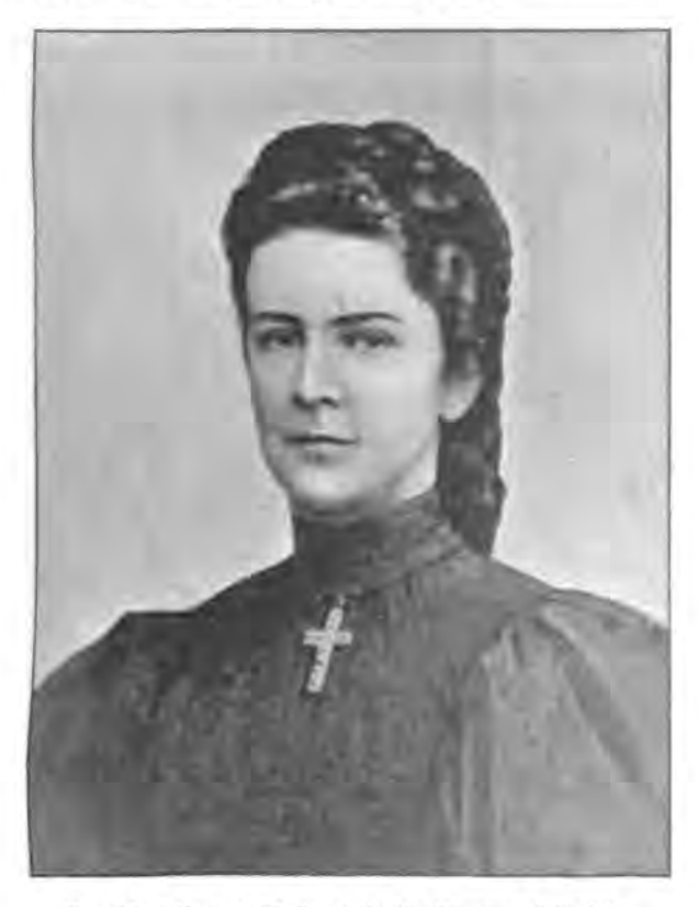
Fig. 18.—Portrait of Elizabeth, the Empress of Austria.

"No," said the lady, "but it looks like royalty." This was inexplicable. Then the impression came to me that it might be the Empress of Austria.