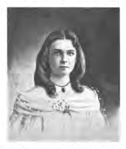
FIG. 69. —Photograph of spirit-painting of the daughter of a prominent Marion family who are not spiritualists.

The picture thus obtained proved to be the likeness of a daughter of a prominent Marion, Indiana family, who are not spiritualists in belief, and this was their first visit to Camp Chesterfield. The mother