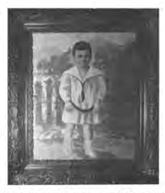
Fig. 67.—Photograph of the portrait obtained of a little boy who passed out of their material life two years previous to the precipitation of the portrait, and of whom they had absolutely no likeness, not even a Kodak.

Our little darling looked just as though he was ready to step down and out of the frame, he is so natural. We fully realise no earthly artist could