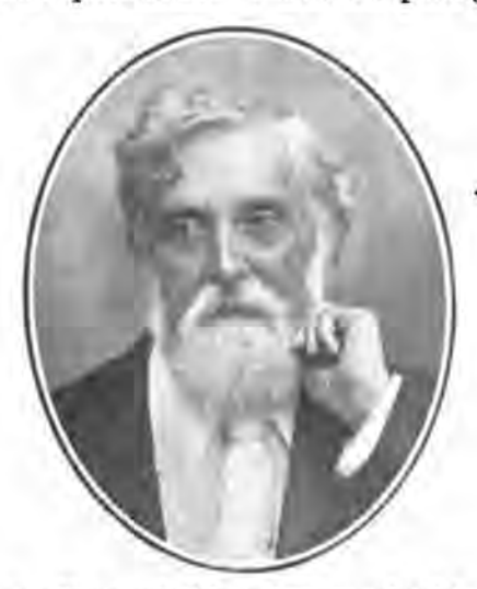
Fig. 24.—Photograph of the author is introduced for comparison with the assumed psychic picture of his father.

At my time of life, my relatives are few in number and are non-spiritualists. I sent the photograph to