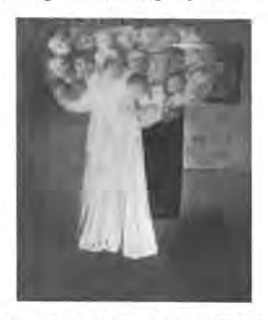
Fig. 39.—Photograph of group of children's faces which enveloped the face and bust of the lady so as to hide them from view, i.e. the visible is not, but the invisible is, photographed.

Concerning this concluding experiment of the