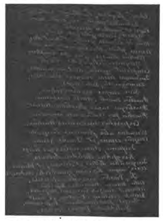
Fig. 87 .- No. 5 Plate of the Birmingham psychographs.

Compescit undâ, Scilicet omnibus, Quicunque terrae munere vescimur,