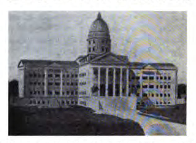
Fig. 72.—Photograph of the psychic painting and architectural design of the Temple of Light, on canvas 4 by 6 feet, done in oil, in the presence of the Bangs Sisters.

fact of the deepest interest to me is that the designs and colouring, etc., of this building were obtained psychically, with strict attention to architectural technique, from which any qualified architect could form his plans. The Temple of Health is a large structure, occupy-