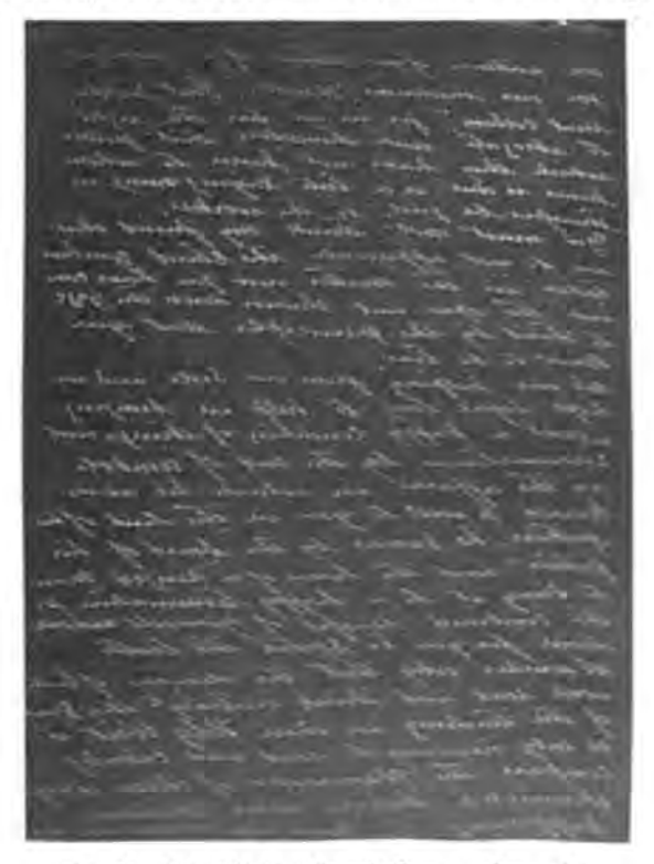
Fig. 84.—No. 2 Plate of Birmingham psychographs.

as old as the world. Sacred history teems with abundant evidence of the fact. The media were Prized by the Medes and Persians. The Delphic