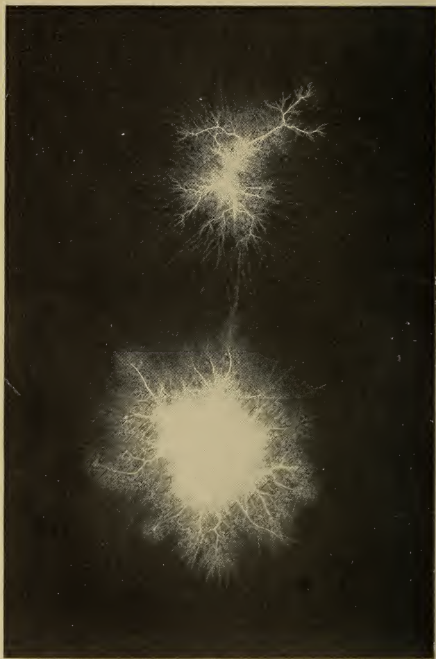
The above is a reproduction of a photograph of an electric spark, showing the Negative and Positive. The white represents the negative, the lines show the positive, the view on the top showing the strongest positive effect.