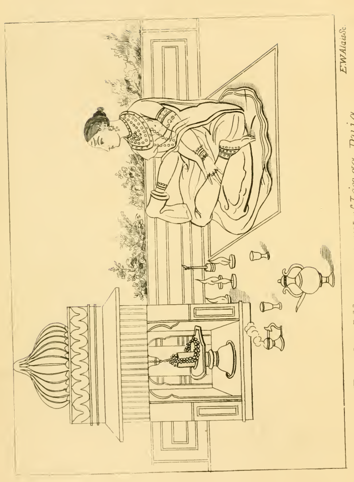
Female at the ceremony of Linga Puja.