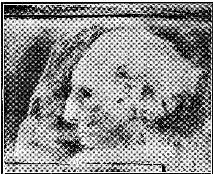
Alleged psychic picture now appearing on the east wall of Christ Church Cathedral, Oxford, and thought by some to bear a resemblance to the late Dean Liddell.