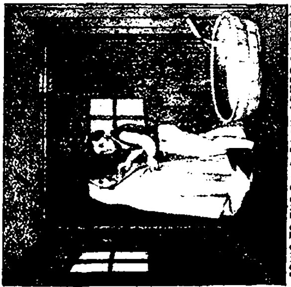
GOING TO THE COLD BATH AFTER SWEATING.