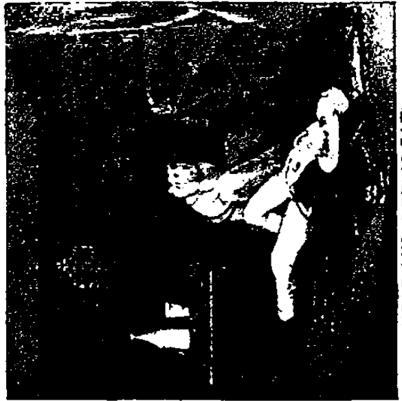
HEAD AND SITTING BATH.