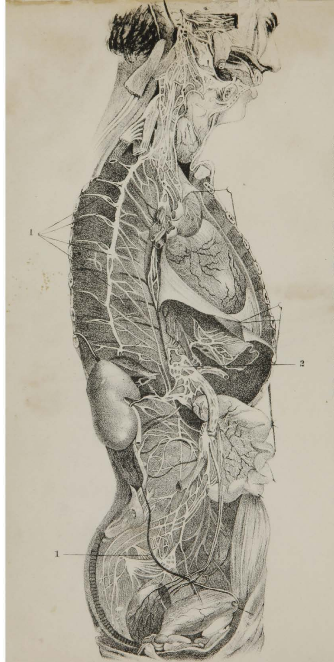
THE NERVES OF THE LUNGS, HEART, STOMACH, AND BOWELS.