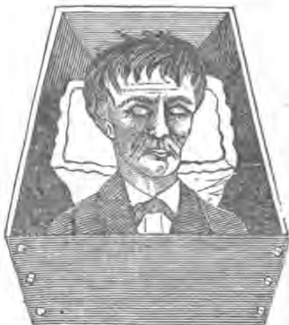
NO. 3.—SEVEN YEARS LAND HIM IN A COFFIN.

wonder how a man can become more degraded or suffer more from this filthy vice. I will close this sickening memoranda by suggesting that our Supervisors remove these poor sufferers to the city, and place them on exhibition, for the benefit of the young and as a terrible warning to such as might otherwise become the victims of this debasing vice."