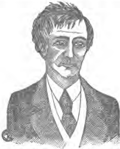
NO. 2.—AFTER MASTURBATING FOR THREE YEARS

was totally incapacitated for any kind of labor. He was bent half double, leaning against the wall, with both hands pressed against his generative organs. So completely had he