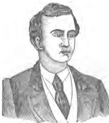
NO. 1.—BEFORE YIELDING TO THIS LOATHSOME VICE.

yield to this awful vice. Fathers and mothers would you like this as a picture of one of your children? See engravings, and mark the awful changes wrought by this damning vice.