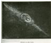
Click to enlarge Nebula in the Lion