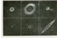
Click to enlarge Annular Nebula'