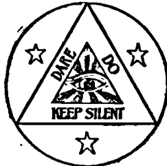
Emblem of Order and Structure of the Phisicians of God 1900

The symbol of an Order is its standard or flag. It symbolizes both its source, its object and its policy and sets the standard by which it must be judged. Hence it is important that persons belonging to or coming in touch with any Order or Movement should understand something of the emblem by which it is known on the higher planes.