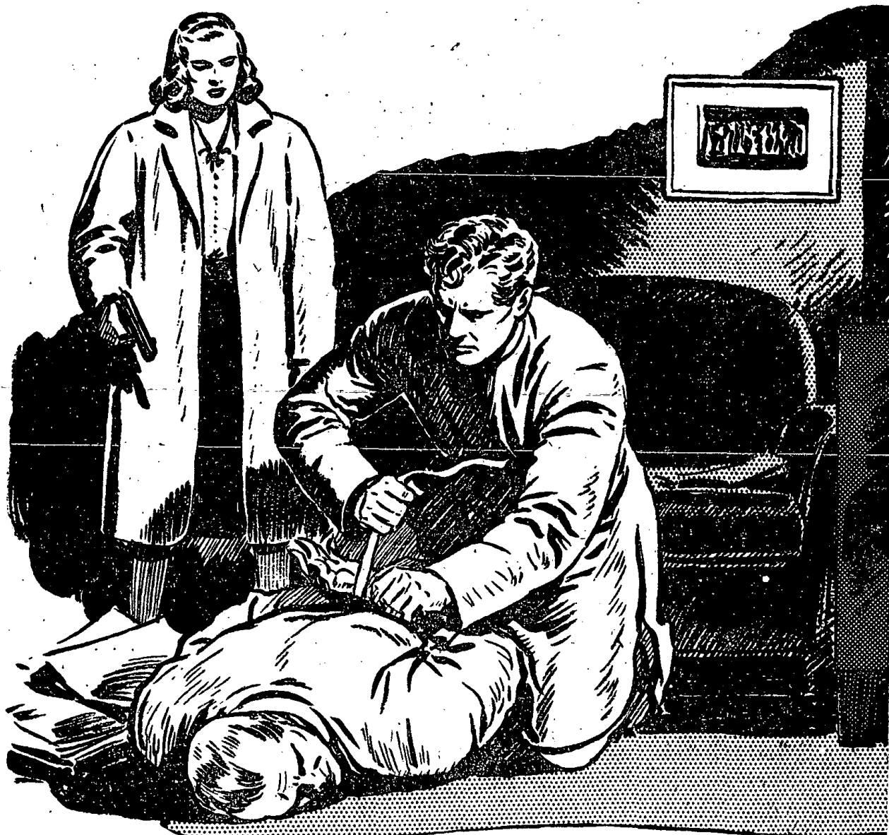
While Clare Logan held the gun steady in her hand, Tom Finley tore off a long piece of

"Right!" said Tom, grimly, "We're out of the ward, but how do we get out of the hospital?"