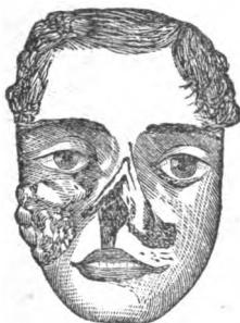
DESTRUCTION OF THE NOSE BY SYPHILIS, AND ULCER ON THE CHEEK.