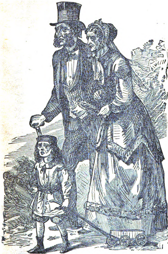
VICTIMS OF SELF-ABUSE, AND THEIR OFFSPRING. “Neither can a corrupt tree bring forth good fruit.”—Matt. vii. 18,