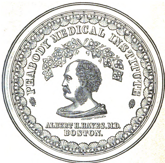
Fac-simile of obverse side of the Gold and Jewelled Medal presented to the author of this work by the National Medical Association.