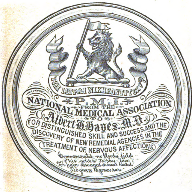
Fac-simile of reverse side of the Gold and Jewelled Medal presented to the author of this work by the National Medical Association.