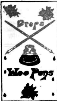
SEE WISDOM LIBRARY VOLUME V

In presenting these little books to the public we claim for them the originality of being the first of their kind ever published. Over two years ago the little contributors to WEE WISDOM were promised that their best efforts at story waiting should be gathered together in a small book, and their names appended as the authors thereof. Now it so happened when this gathering together was made, there were found to be more "Drops From Wee Pens" than one small volume could hold, hence the overflow called forth a second volume, which our young artist presents to you cloud-and